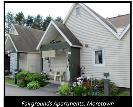
Fairgrounds Apartments, Moretown

At the Shady Pines Mobile Home Park in Westminster, the northern septic disposal field was replaced. This system serves 13 of the 28 lots; its proper function is critical to the future viability of this property.