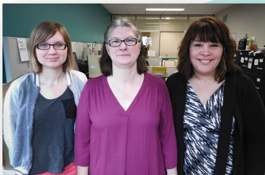
Section 8 Intake Staff