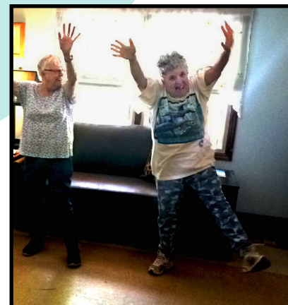
Residents enjoy dancing with their SASH Coordinator during the Winter Walk and Rock at Welden Villa Apartments in St. Albans.

SASH participants have recurrent access to SASH Coordinators, as well as contracted Wellness Nurses. SASH provides a range of services and offers a diversity of social and educational opportunities. Some highlights from 2015 were weekly blood pressure clinics, Tai Chi classes, Wii bowling tournaments, the FarmShare program, varied exercise activities, prescription management and other health