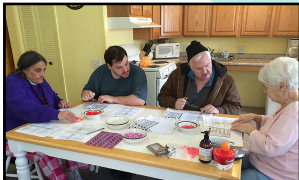
SASH participants at Swanton Village Apartments in Swanton help each other learn new Bingo patterns during Winter Wazoo Bingo.

For nearly two years, the Vermont State Housing Authority has been participating in the Support and Services At Home (SASH) program, which is part of Vermont's statewide health care reform initiative, the Blueprint for Health . SASH within VSHA serves housing communities in Middlebury, Milton, St. Albans, Swanton, and Northfield. Through this program, over 250 individuals were provided services in 2015.