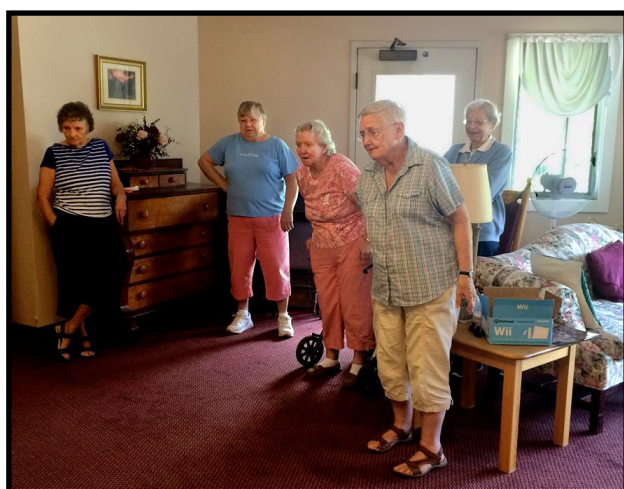
Green Mountain Apartments, Northfield SASH participants show off their spares and strikes during a monthly Wii bowling tournament.