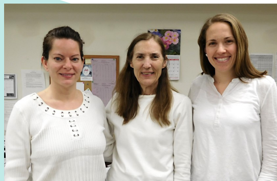
FSS / Homeownership Staff