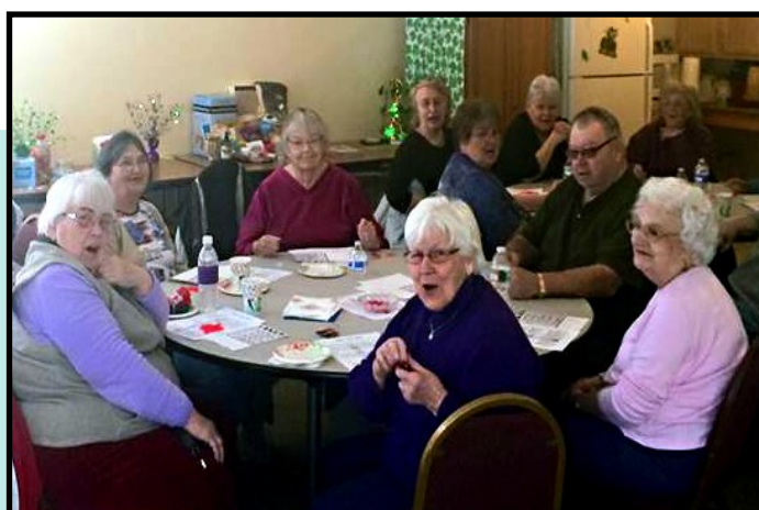
At Meadowlane Apartments in Milton, participants in the yearly Practical Prize Bingo win items such as dish soap, heated blankets, canes and dryer sheets. Entry was free and the event was funded entirely by SASH.